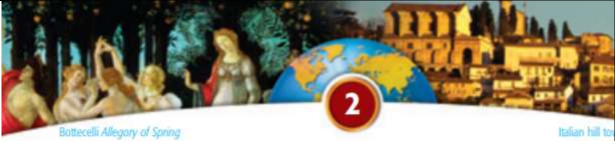
Botticelli Allegory of Spring