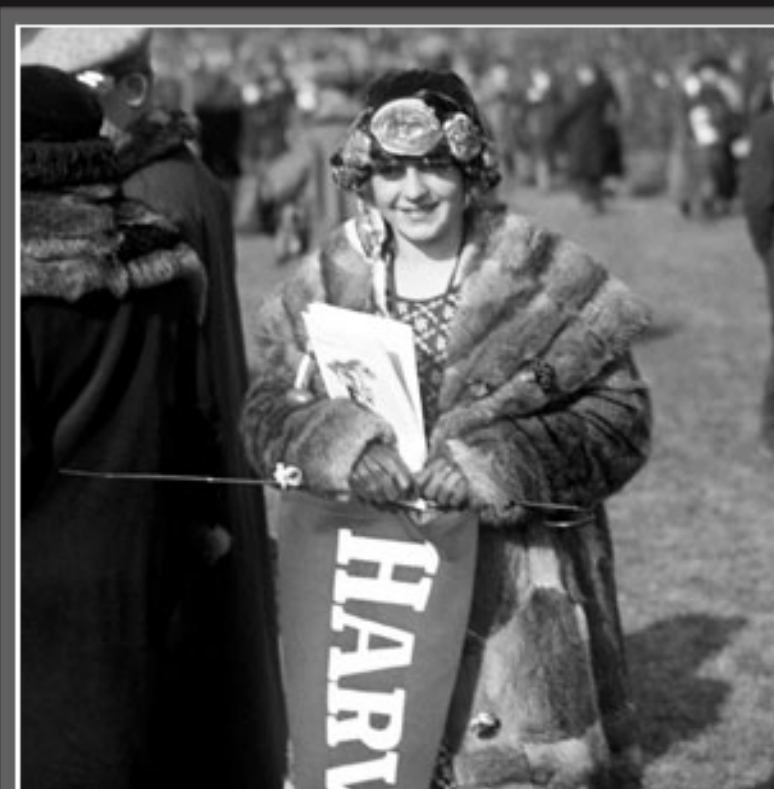
Nov. 10, 1923. A woman holds a Harvard pennant at Princeton University during a football game between the two schools.