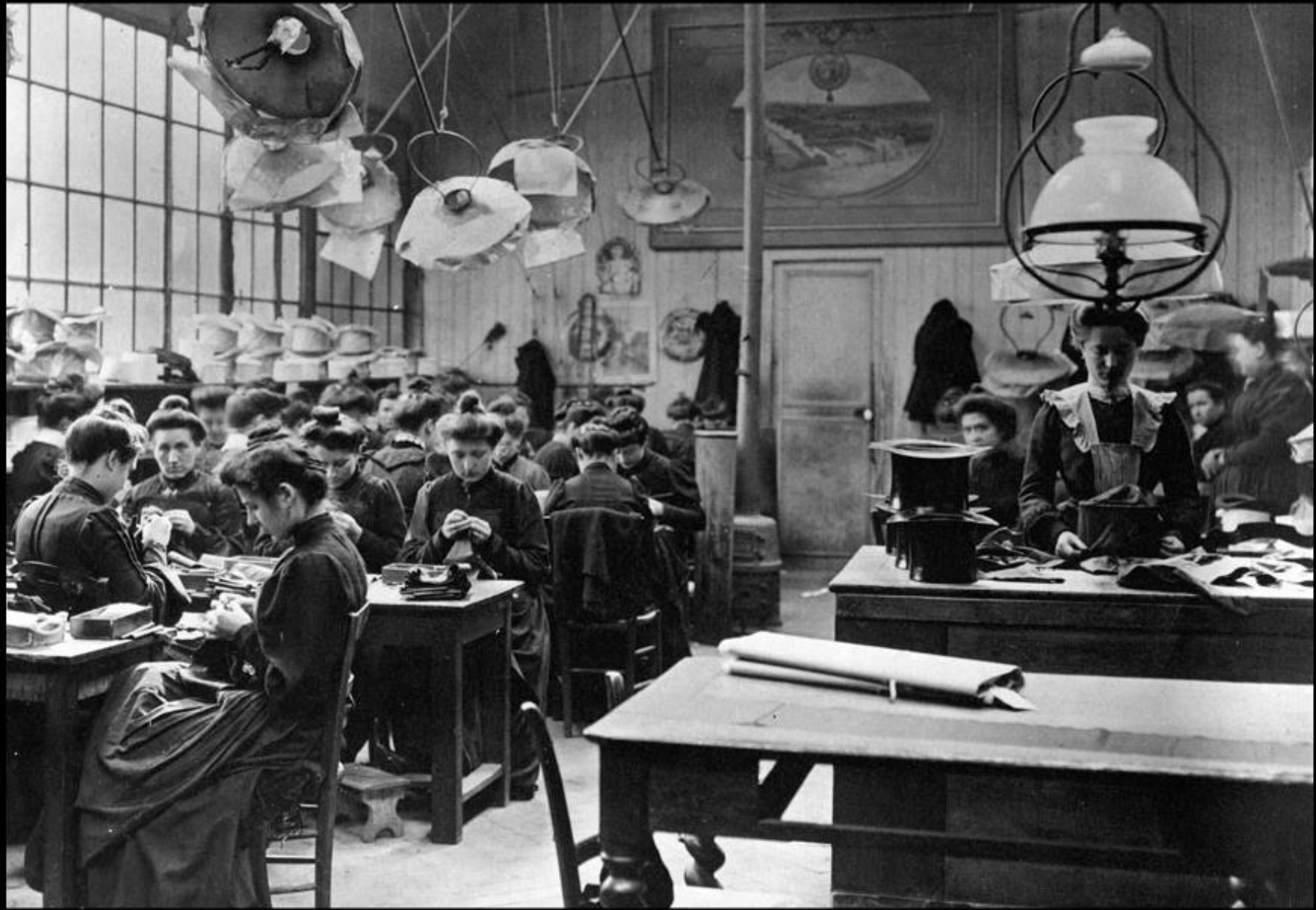
Women factory workers.