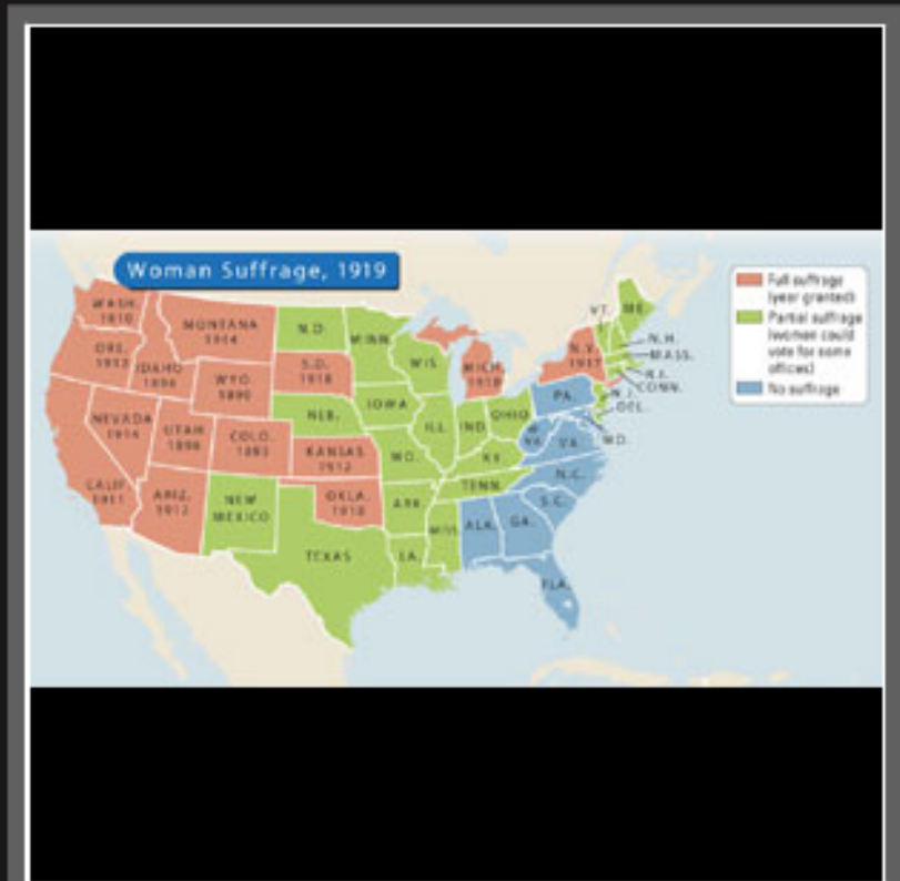
Woman Suffrage, 1919.